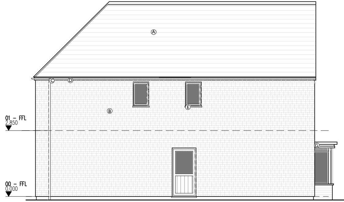
SIDE ELEVATION PLOT 1 (PLOT 4 HANDED)